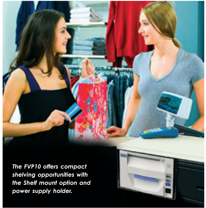
The FVP10 offers compact shelving opportunities with the Shelf mount option and power supply holder.